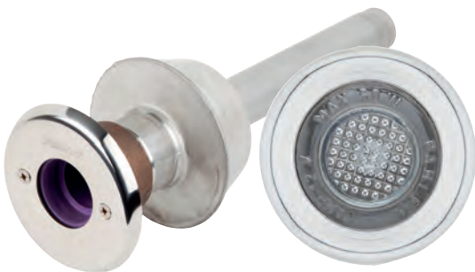
Non leak flange